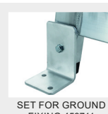
SET FOR GROUND FIXING 453711