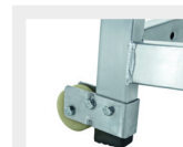
WHEELS SET 453710