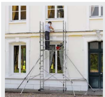
SPEED'UP XL - PLATFORM HEIGHT 3,00 M

STRUCTURE IN ALUMINIUM TUBES BRINGING OPTIMAL STABILITY