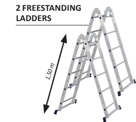
2 FREESTANDING LADDERS

DELIVERED WITH 4 STABILIZERS Possibility to use both ladders as stepladders simultaneously.