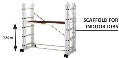
SCAFFOLD FOR INDOOR JOBS